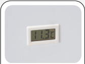
Digital thermometer display